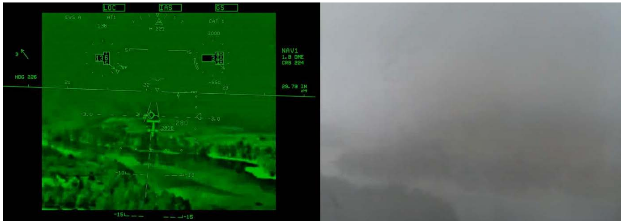
Figure 1. View During an Approach With EFVS (Left) and Without EFVS (Right)